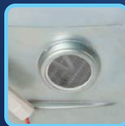
Sight Window to Combustion Chamber