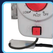
Integrated Piezo Igniter