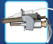
Thermopile (no electricity required)