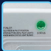
Gas Control Valve with Exclusive GREEN LED Indicator